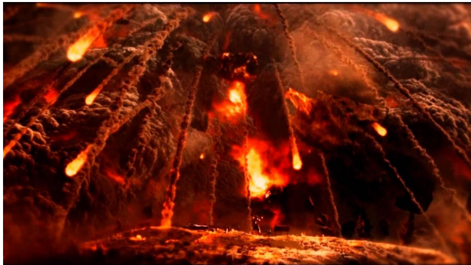
Fire from Heaven - YouTube

And they (Satan's demonic army) went up on the breadth of the earth, and compassed the camp of the saints about, and the beloved city: and fire came down from God out of heaven and devoured them (Rev.20:9). Please notice that even though King Jesus will be ruling the world from the beloved city, the camp (locations) of the saints will be the entire breadth of the earth.